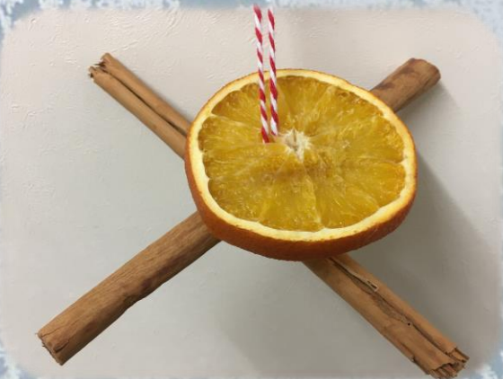
Orange & Cinnamon