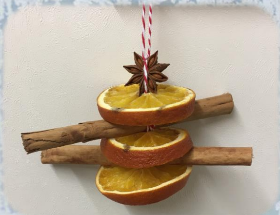
Orange, Cinnamon & Star Anise